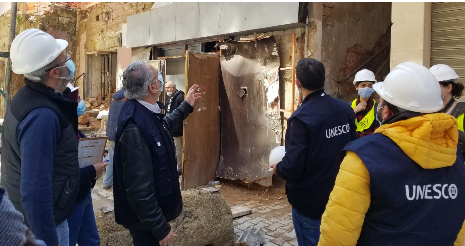
A UNESCO team checks one of the century-old buildings in Beirut 2020 at risk of collapse. It was stabilized and temporarily covered before the rainy season by UNESCO, with the support of Germany.

UNESCO has been at the forefront of international efforts to mitigate and combat the COVID-19 outbreak and public health crisis. UNESCO developed tools to ensure the continuity of education, with a global education coalition, bringing together over 180 public and private partners and provided global real-time data on school closures. UNESCO spearheaded the global ‘Resiliart’ movement, organizing hundreds of debates to support and reinvent cultural policies at a time when museums, cultural sites, concerts and cultural practices and jobs were under threat. COVID-19 reminds us that scientific cooperation is key when we are confronted with a global public health issue. It is also stark reminder of the importance of quality, reliable information, at a time when rumors are flourishing.