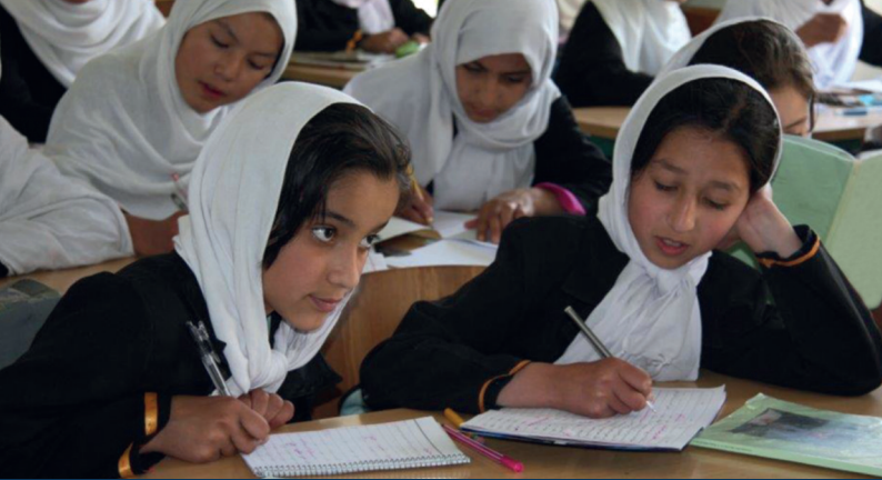
Young girls at Aisha Durani School, Kabul, Afghanistan. The UNESCO Initiative, the Global Partnership for Girls' and Women's Education.