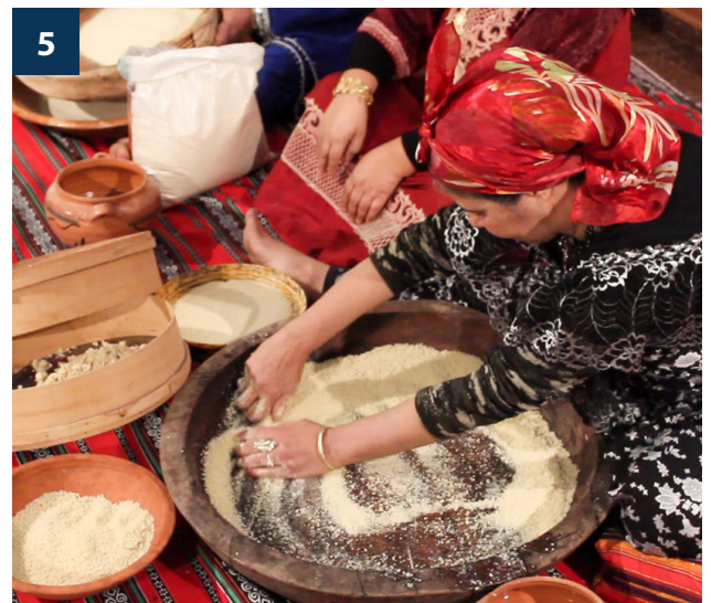
5. Couscous know-how and traditions, UNESCO Intangible Heritage, 2020