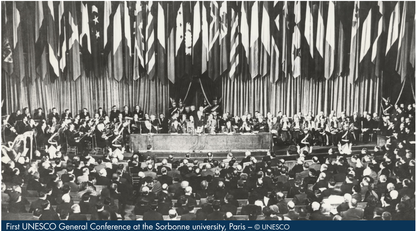
First UNESCO General Conference at the Sorbonne university, Paris