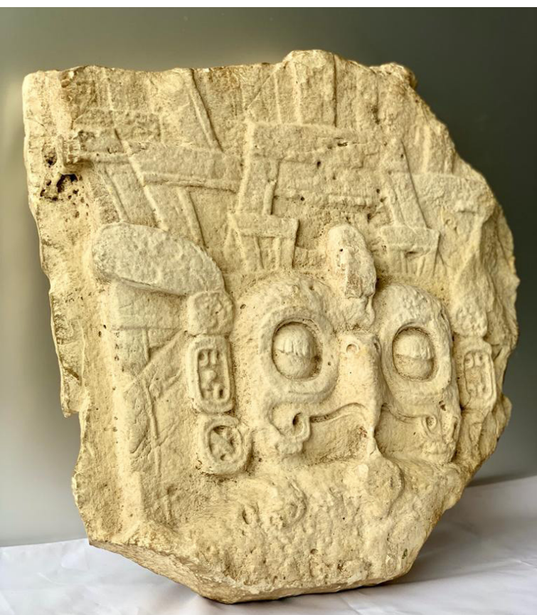
Guatemalan Stele which was recently handed back to Guatemala

When African independent journalists met in Windhoek, Namibia for a UNESCO conference on the role of a free, independent and pluralistic media, they shared experiences of the constant pressures and violence they and other journalists across the continent were facing. The declaration demands that governments should be proactive in protecting journalists and advancing opportunities for citizens to exercise freedom of expression, and that they should avoid controlling the media, and forbid State monopolies on the media. UNESCO has since developed a global network to support and protect journalists.