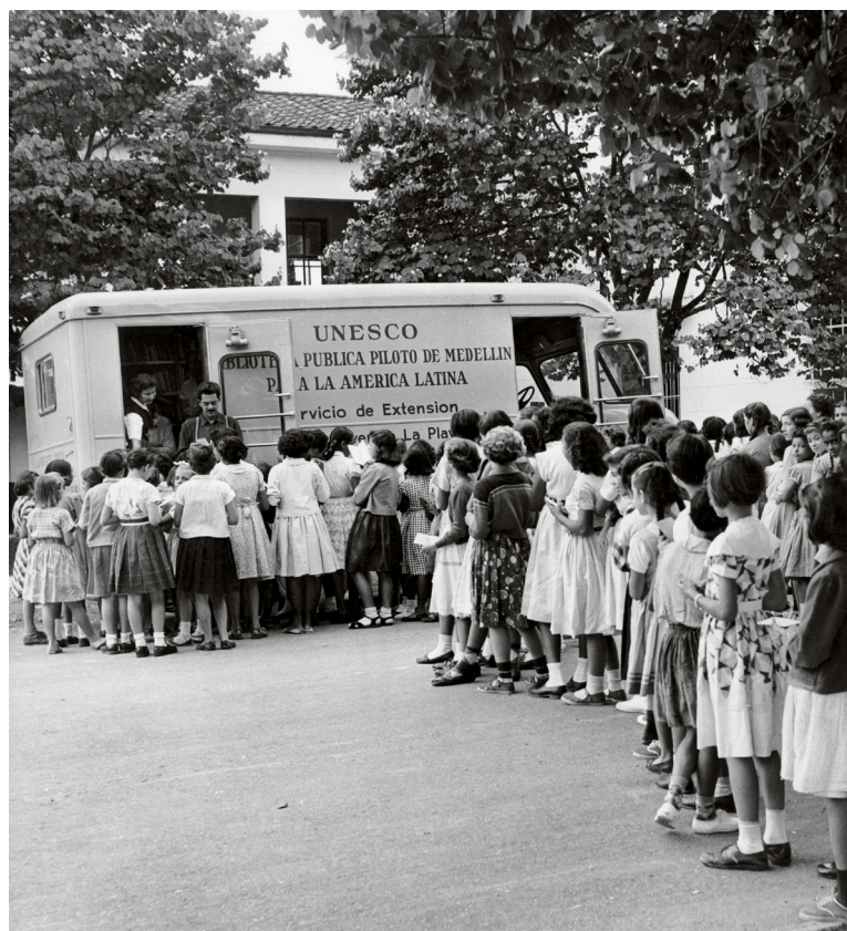
1955 - Colombia. An eager queue of girls at a UNESCO mobile library in Medellín.

Three years after their destruction by extremists, the Timbuktu mausoleums were fully restored by UNESCO through extraordinary work carried out by local craftsmen and with international support. The oldest of these buildings were built in the 13th century. Sixteen of them are inscribed on the World Heritage List. Fourteen were destroyed in 2012, representing a tragic loss for local communities and humanity.